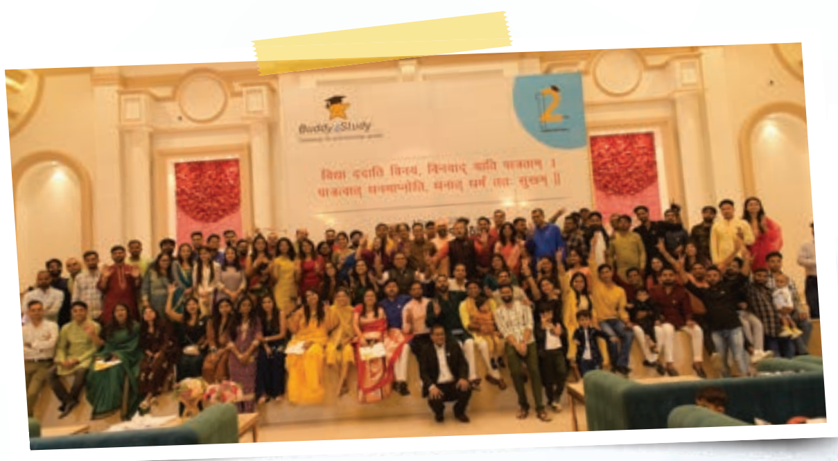
Buddy4Study's 12th Foundation Day