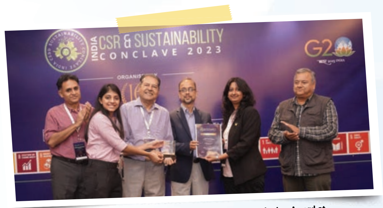
Buddy4Study has been awarded the Diversity and Inclusion Award at the CSR & Sustainability Conclave 2023 at the India Habitat Centre, New Delhi.