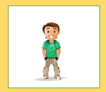
Children aged less than 10 years