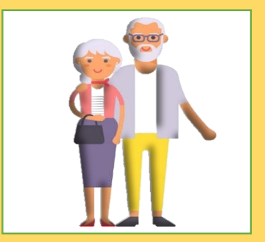
People aged more than 65 years