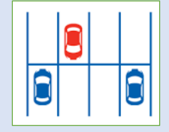
Proper Crowd Management in Parking Lots and outside the premises