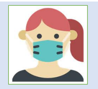
Workers/Customers /Visitors to be allowed entry only if wearing masks